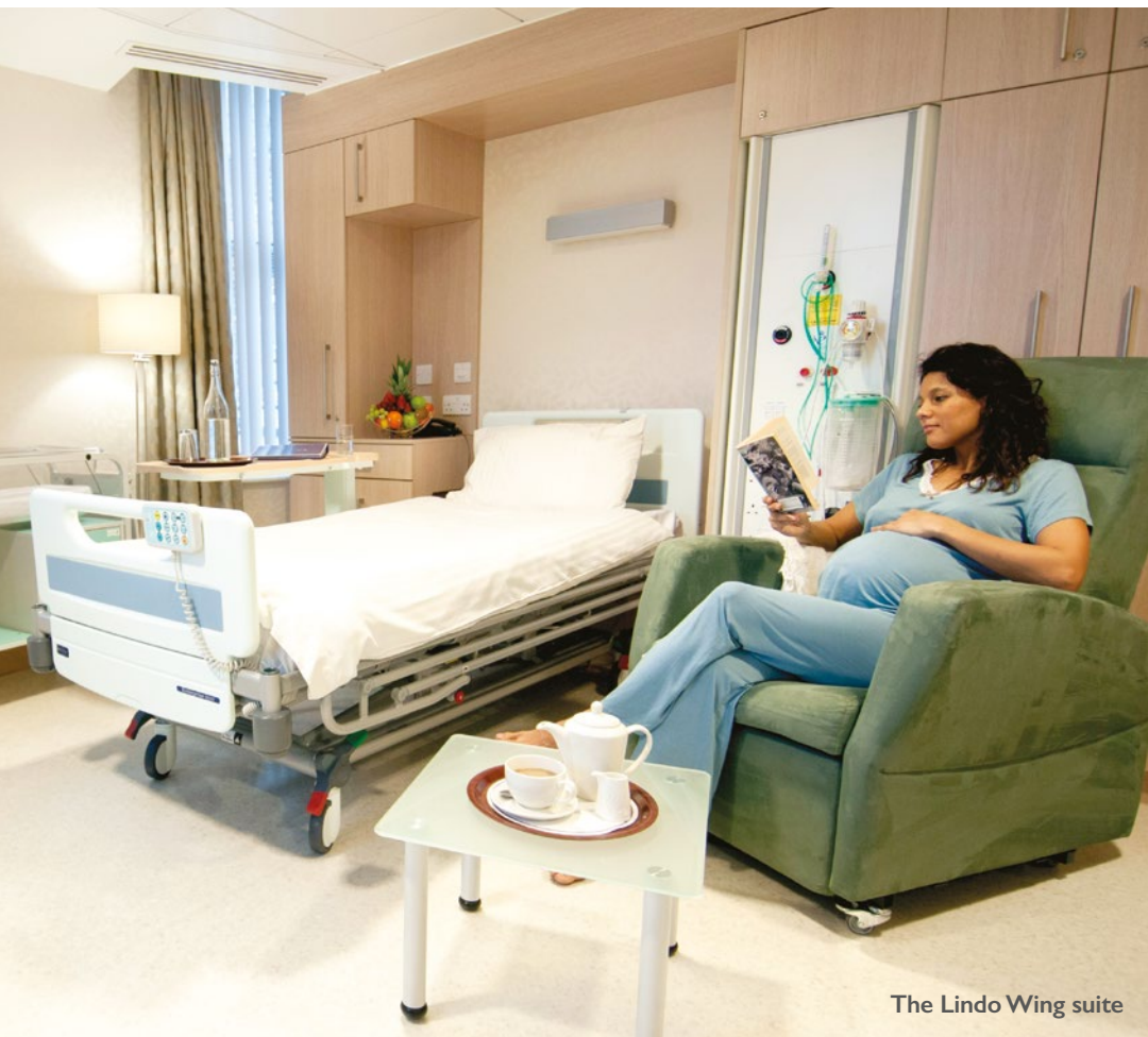
The Lindo Wing suite